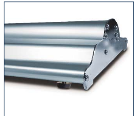
A simple design that's stable on all surfaces.