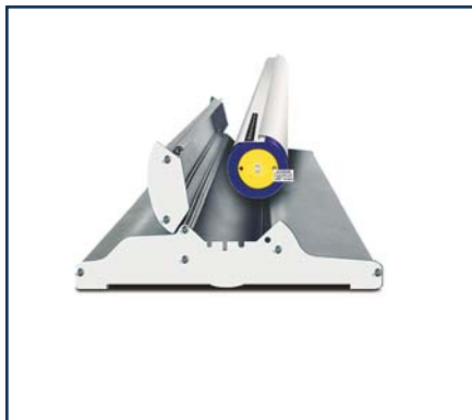
The image is well protected during transportation.